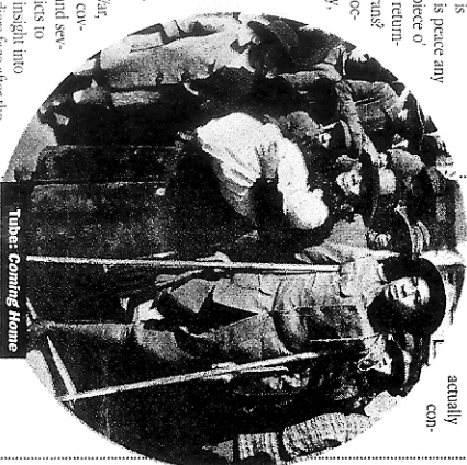
Tube: Coming Home

From the American Revolution to the Persian Gulf War, Coming Home covers 200 years and serves as a major conduit to provide much insight into what fights soldiers face after the battle.