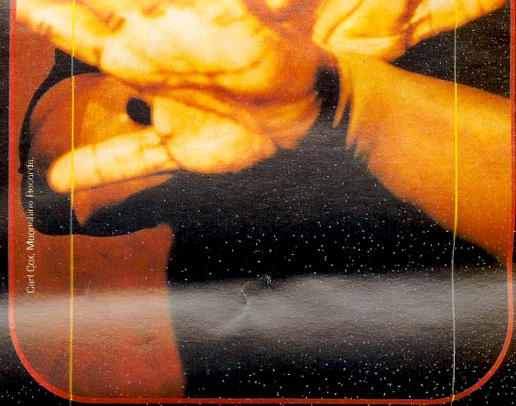
Carl Cox, Moonwalks Records