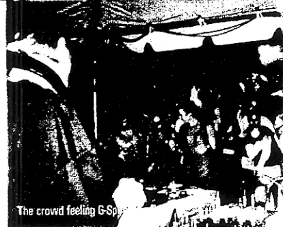
The crowd feeling G-Spot